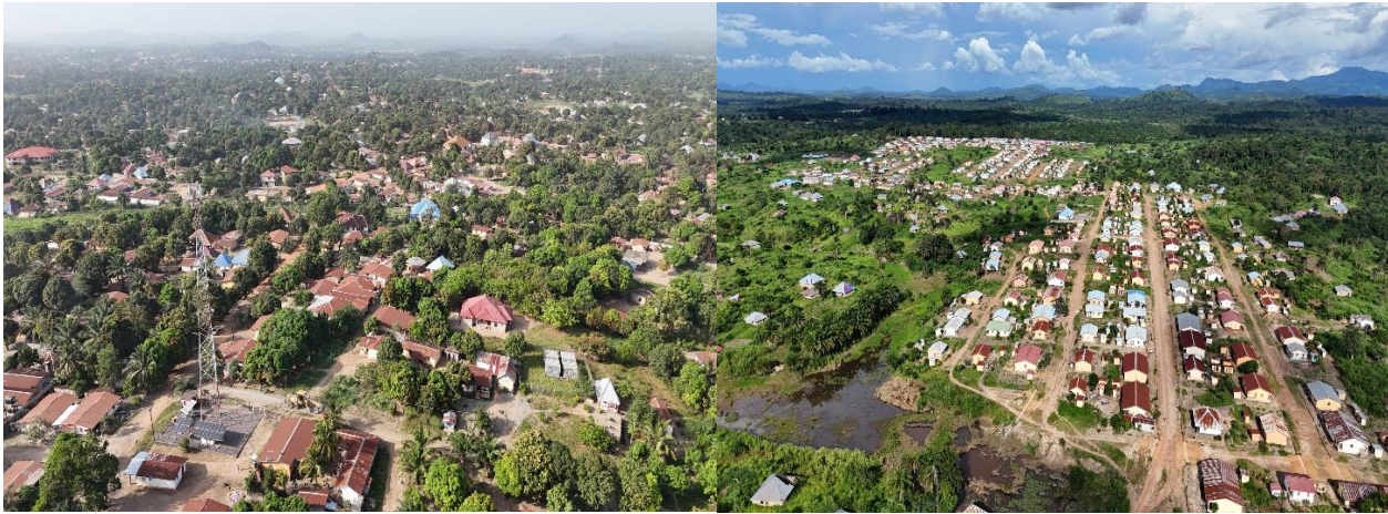
Figure 3: Showing older town of Kimbadu with mature economical trees and newly completed resettlement town of New England awaiting the distribution of economical trees with support from MAFF. as part of our reforestation and lively hood sustainability to our communities .

The “ Vegetable Basket ” garden concept transformed in January 2015 into a protected garden shed/tunnel to the community office compound has been in use since late 2017. This system can be adopted and built by any keen gardener by using locally available material like bamboo, sticks and cheap nettings at low cost as a backyard income generation garden.