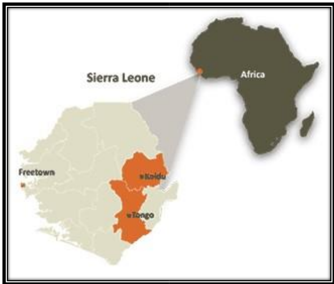
FIGURE 1 REGIONAL LOCALITY