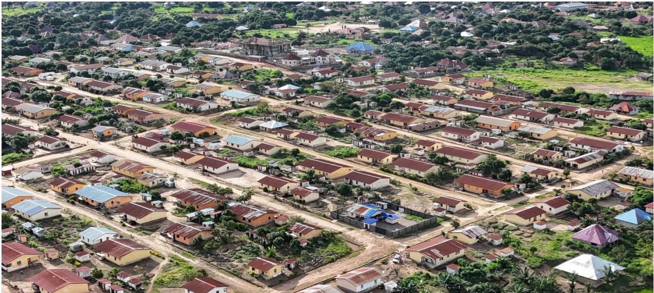
Figure 6: Drone view of Resettlement and access road's rehabilitated since July to Nov. 2024.

40% of the $40,000.00 allocated for school levers scholarship award has been allocated for the continuation of Tertiary students $16,000.00 and $24,000.00 to the support for Technical -Vocational school levers training since 2020 academic years. This decision is in line with policy to support both technical -Vocational and Tertiaries students.