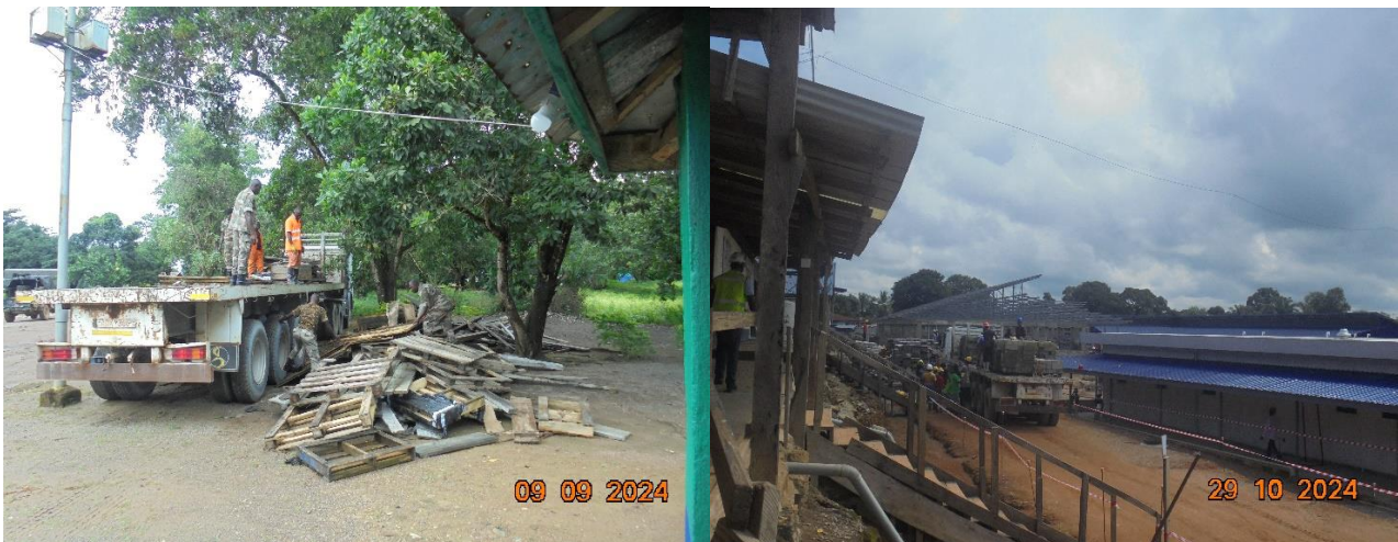
FIGURE 5: Supply of wooden pallets to 9 th Battalion in Koidu and building construction material support to PIH/BHI New Maternal building at KGH in Koidu city October 2024