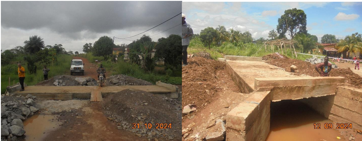
Figure 4: Koidu Ltd completed box culverts at Sundu Bar junction & UMC -Bengasy road Sep -Oct. 2024.

Presently most of the resettled communities under RAP 1 & RAP new site have established hair dressing salons, market Stalls, cooked food centres (cookerie shop) soft drinks & bars, dressmaking shops and video club centres. These are being established by the individuals when and as demands are identified.